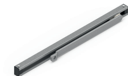
Guide Rail (With or Without Hold Open Function)